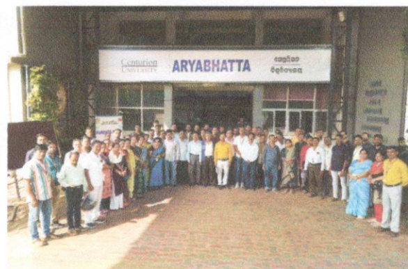
Gimpse of the Attendees during PTM