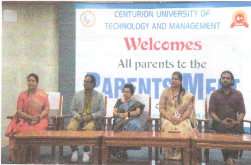
Deans on the Dias