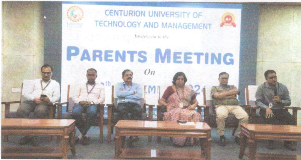
Senior Management on the Dias