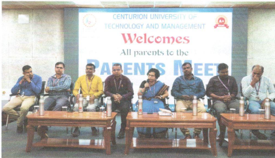
Dean, Associate Dean and HoDs on the Dias